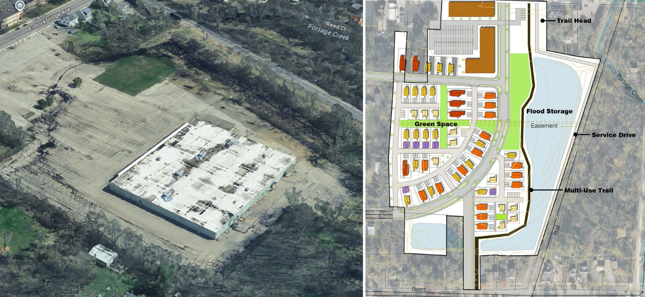
By removing some of the paved surfaces and thoughtfully developing housing with green space and stormwater management, 322 Stockbridge can welcome new residents and become an asset to our community. The concept above is just one option. The final design is not yet determined.

These changes are based on parking studies and usage data, including the City’s Parking Management Blueprint and updated parking counts from 2024. They’re designed to ensure that parking is available where people want it, while improving the overall experience for everyone who parks