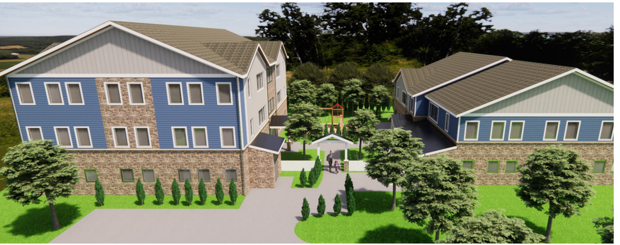
A first look at Kalamazoo Community Courtyard, soon to be a safe, welcoming home for survivors of domestic violence and human trafficking. This project is a great example of the community coming together, and of the complexities of getting this type of housing built.

Community Foundation. Plus, countless volunteer hours from supporters and partners, including Zero Day, Inc., YWCA of Kalamazoo, Visser Construction, and members of Southern Heights Church.