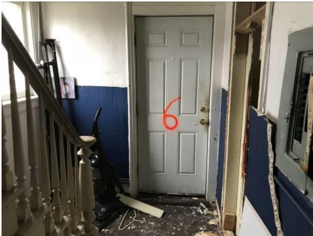
View of the front entry (FS-6)