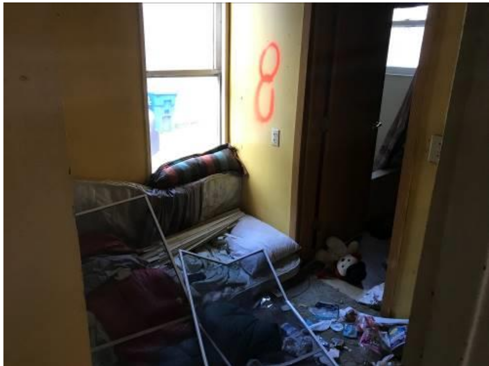
View of the bedroom #2 (FS-8)