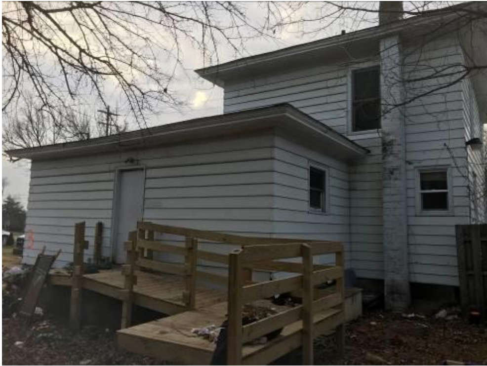
View of the rear of the house (EA-3)