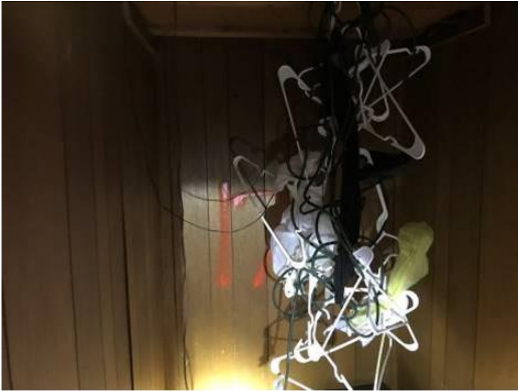
View of the closet (FS-17)