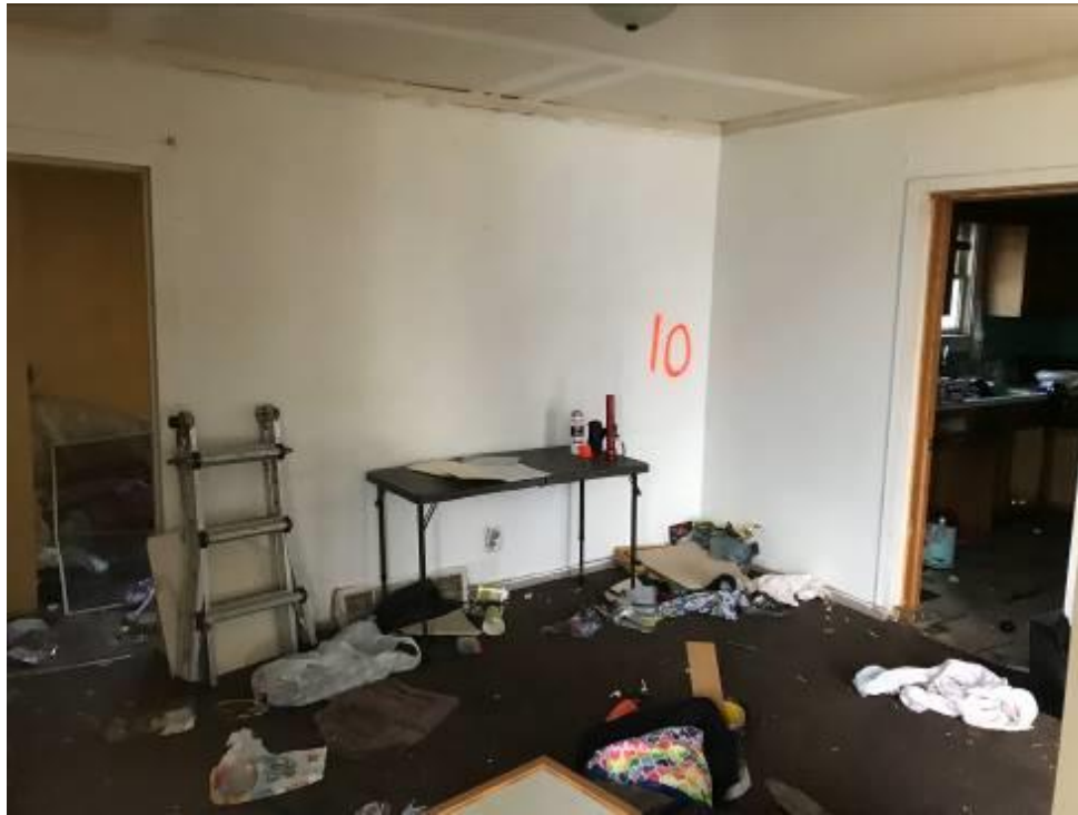
View of the living room (FS-10)