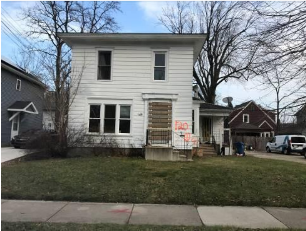
Street view of the house located at 120 Burr Oak (EA-1)