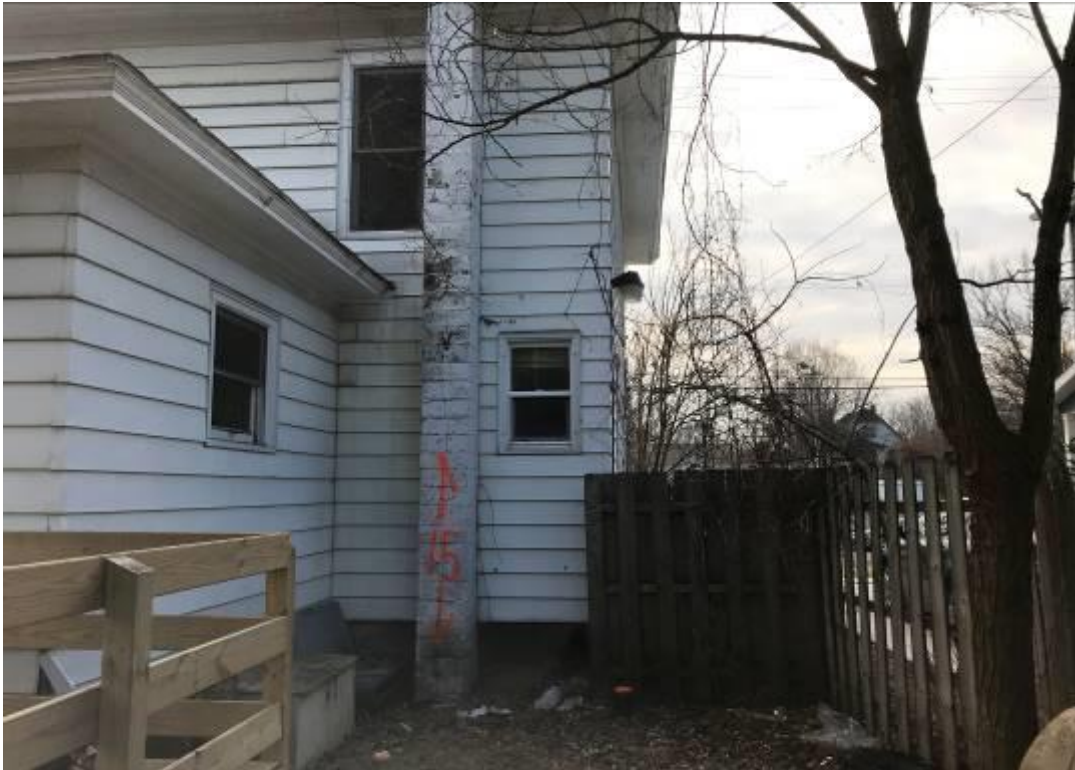
View of the chimney (FS-15)