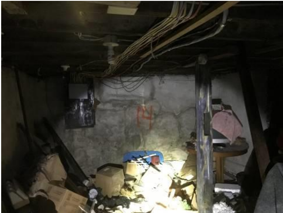
View of the basement (FS-14)