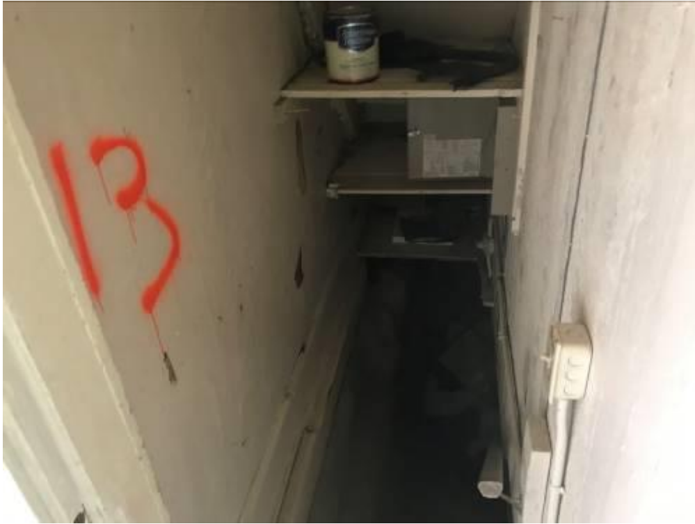
View of the stairway to the basement (FS-13)