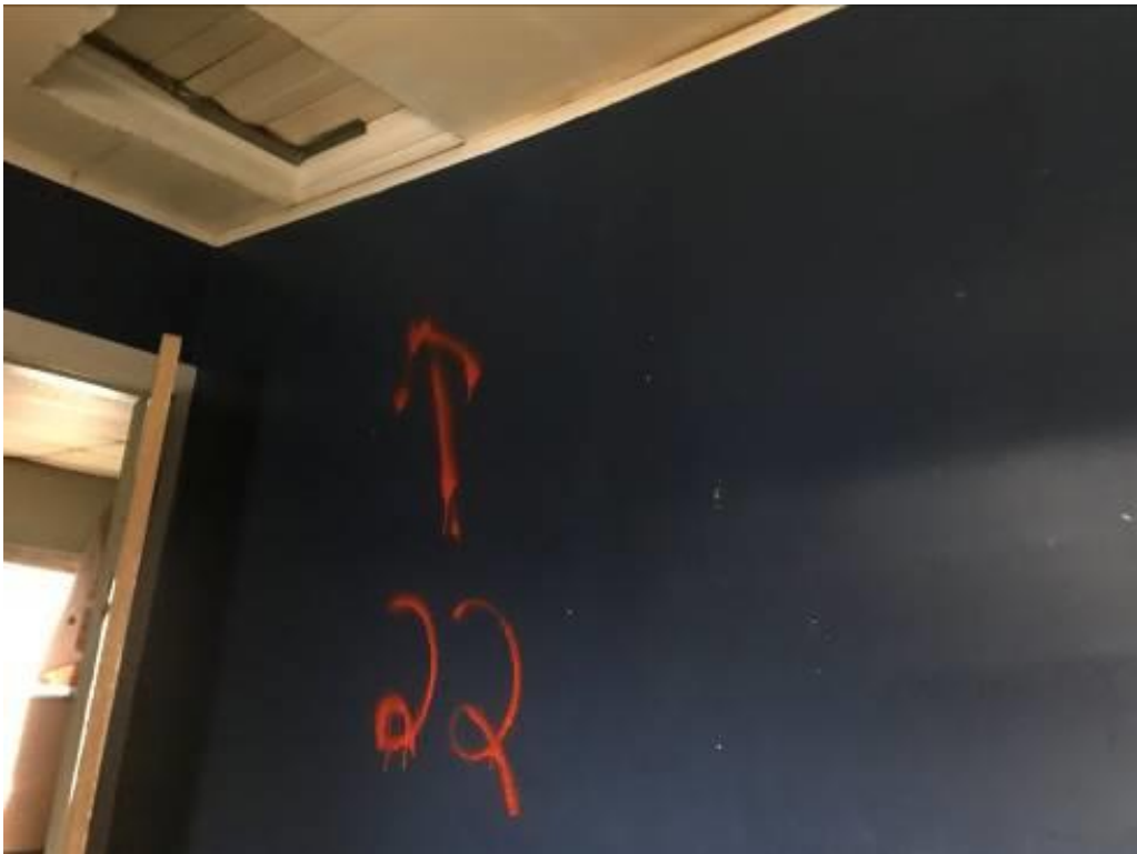
View of the attic access (FS-22)