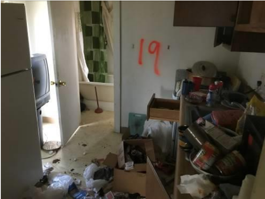
View of the kitchen (FS-19)