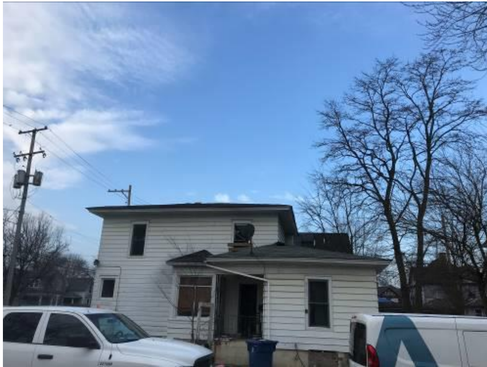
View of the roof (EA-5)