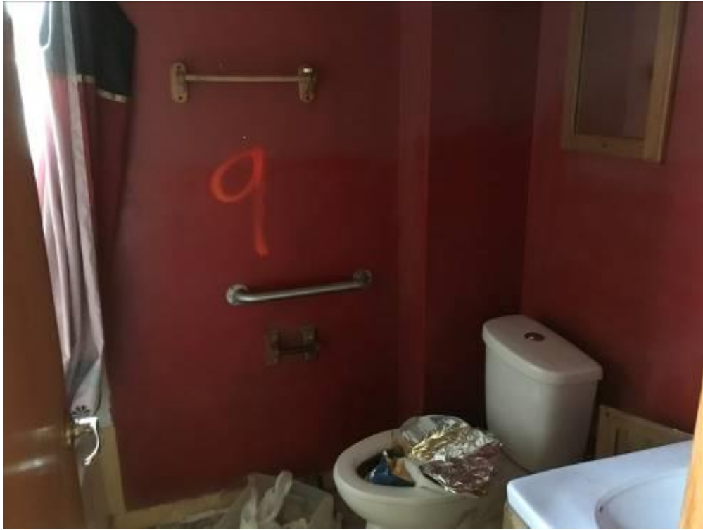
View of the bathroom #1 (FS-9)