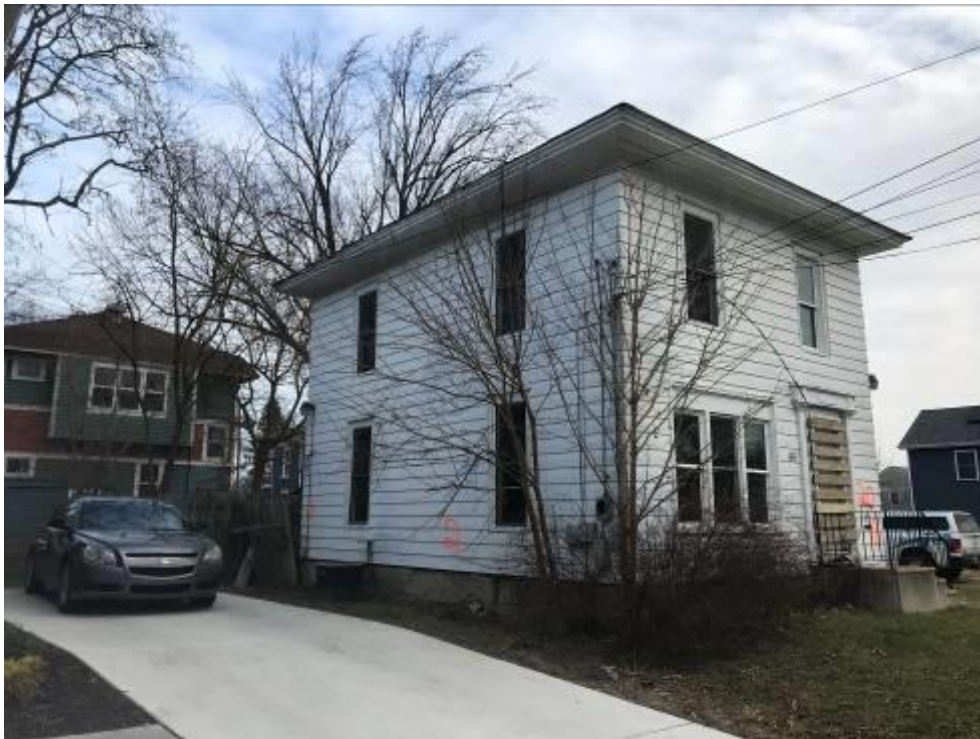
View of the left side of the house (EA-2)