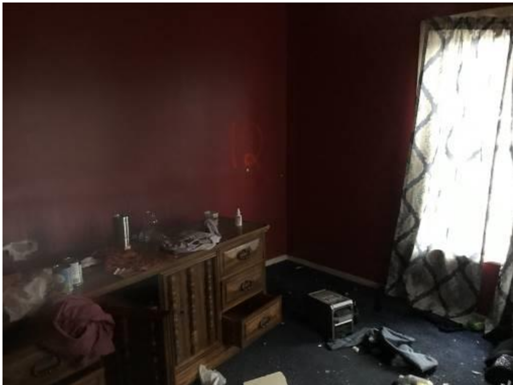
View of bedroom #3 (FS-12)