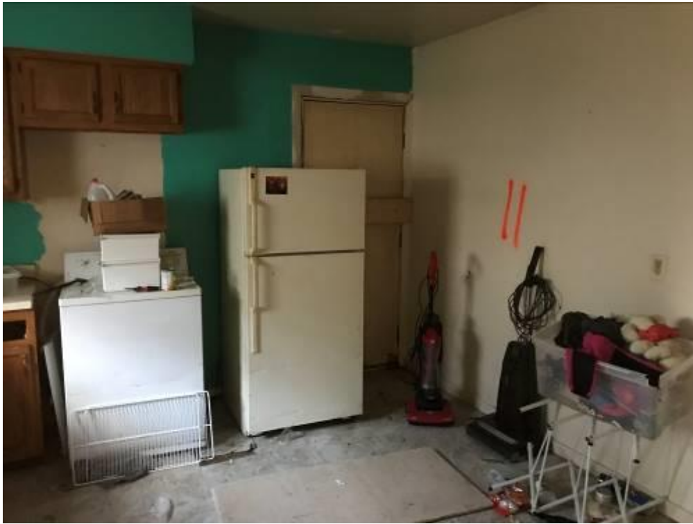
View of the kitchen (FS-11)