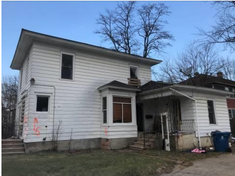
View of the right side of the house (EA-4)