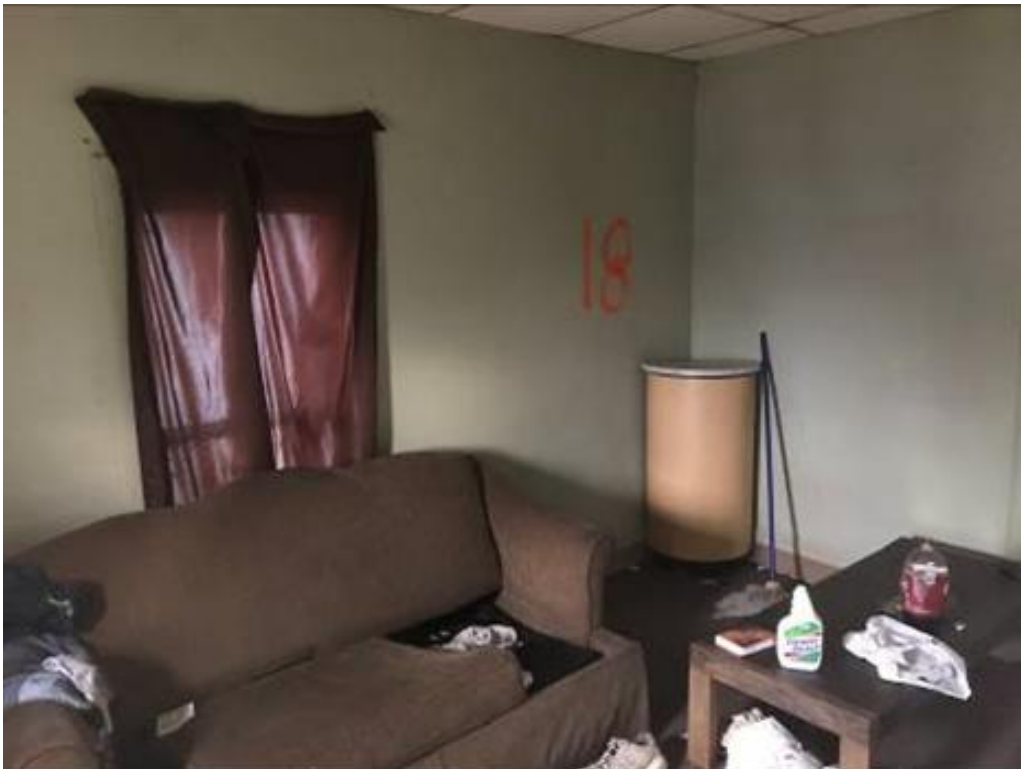
View of bedroom #4 (FS-18)