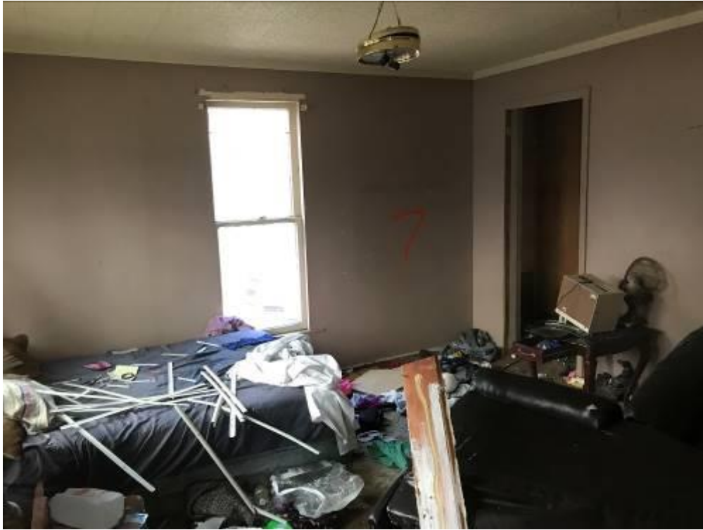
View of bedroom #1 (FS-7)