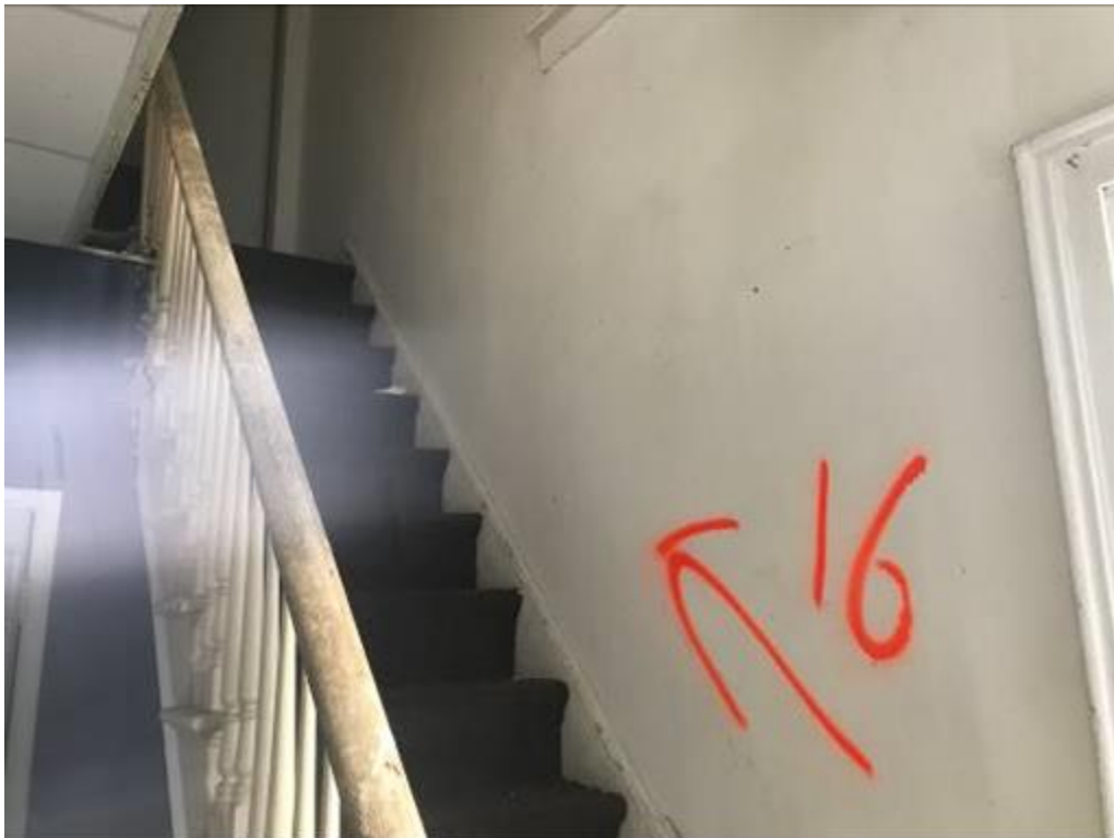
View of the stairway to the second floor (FS-16)