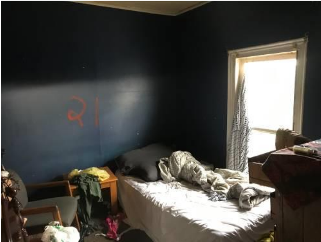
View of bedroom #5 (FS-21)