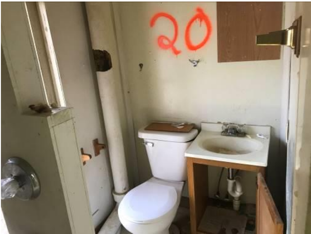
View of bathroom #2 (FS-20)