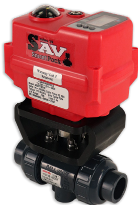
Type-21/21a SST True Union Ball Valves Sizes: 1/2" - 4"

Series 19 SAV Smart Pack® electric actuators can be factory-mounted on Type-21/21a and Type-21a SST ball valves, Type-23 Multiport® ball valves and Type-57 series butterfly valves. Choose from PVC, CPVC, PP, and PVDF valve bodies, and socket or threaded end connectors (ball valves). One part number for valve and actuator packages makes ordering easy. All actuated Smart Packs® are available in the four different models: on/off, modulating, failsafe, and modulating failsafe.