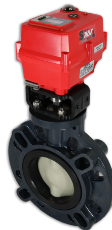
Type-57 Series Butterfly Valves Sizes: 1-1/2" - 6"