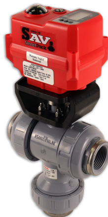
Type-23 Multiport® Ball Valves Sizes: 1/2" - 4"