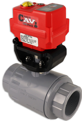
Type-27 Omni® Ball Valves Sizes: 3/8" - 2"