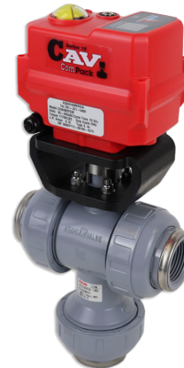
Type-23 Multiport® Ball Valves Sizes: 1/2" - 2"