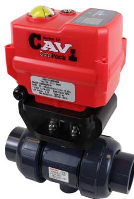
Type-21/21a Ball Valves Sizes: 1/2" - 2"