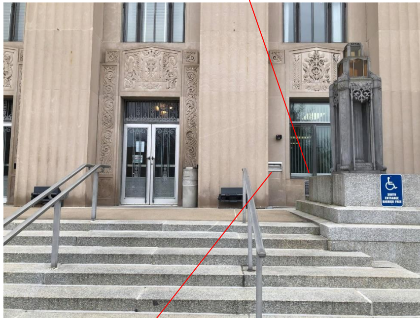
1. Open drop box located at City Hall.