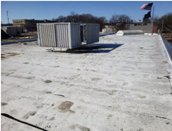
Section 4 Overview.