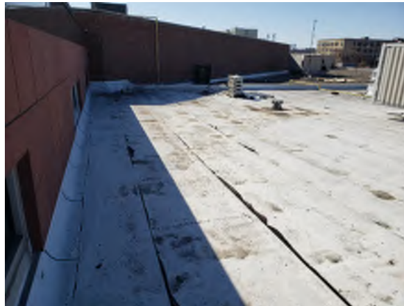
Section 4 Overview.