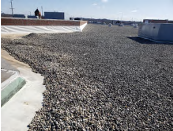
Section 1 Overview.