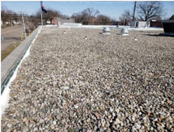
Section 3 Overview.