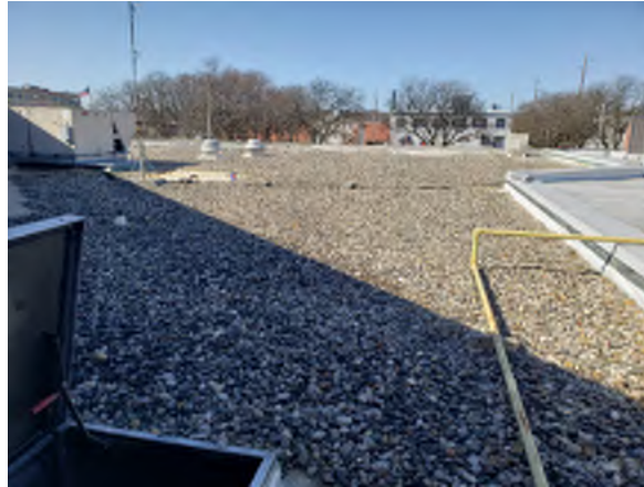
Section 3 Overview.