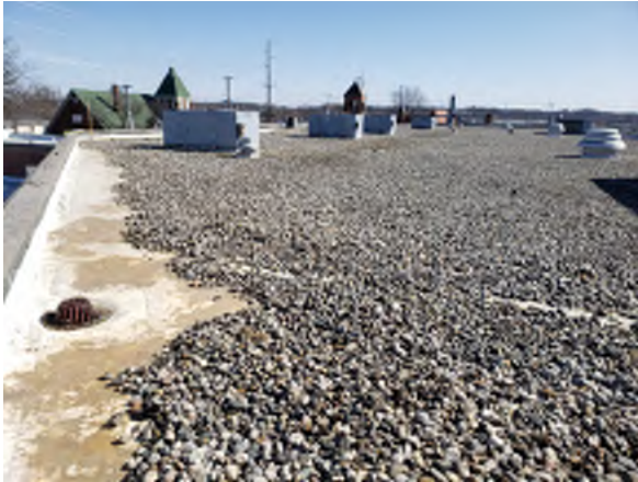
Section 2 Overview.