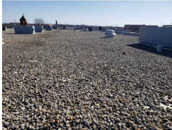
Section 2 Overview.