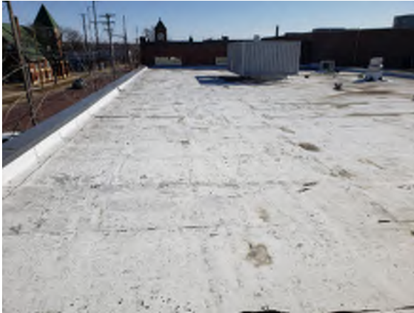
Section 4 Overview.