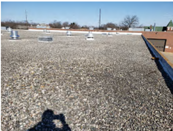
Section 1 Overview.