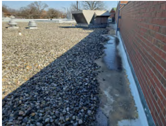
Section 3 Overview.