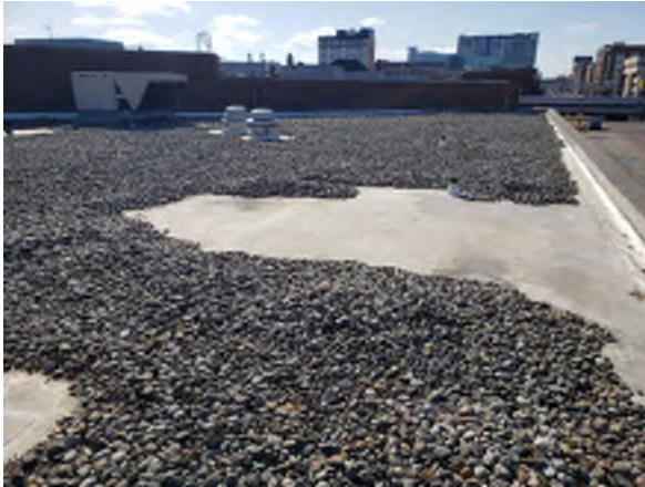
Section 3 Overview.