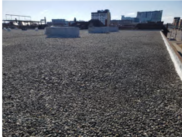
Section 1 Overview.