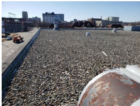
Section 2 Overview.