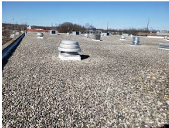
Section 1 Overview.