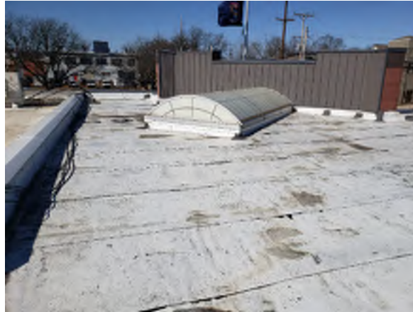
Section 4 Overview.