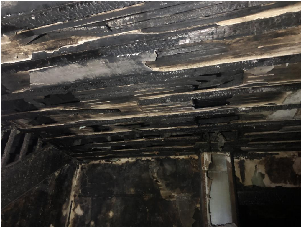
View of the fire damaged 2 nd floor joists continued