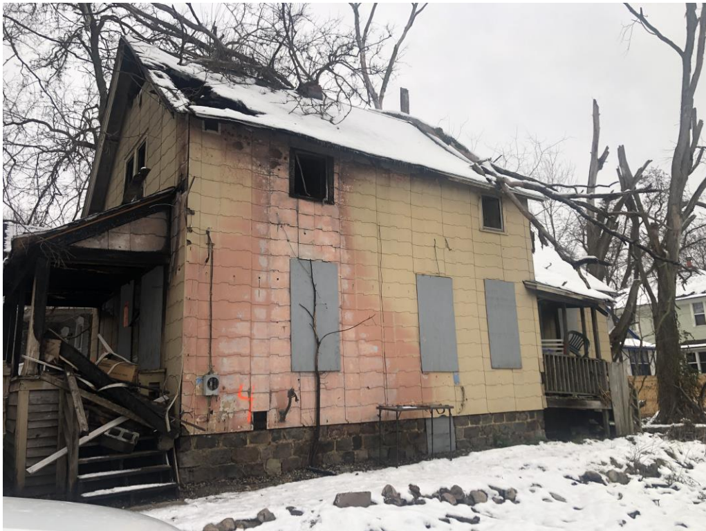
View of the right side of the house (EA-4)