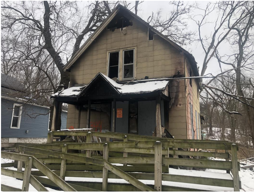
Street view of the house located at 1344 East Main Street (EA-1)