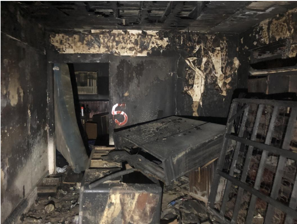
View of the house interior (FS-1)