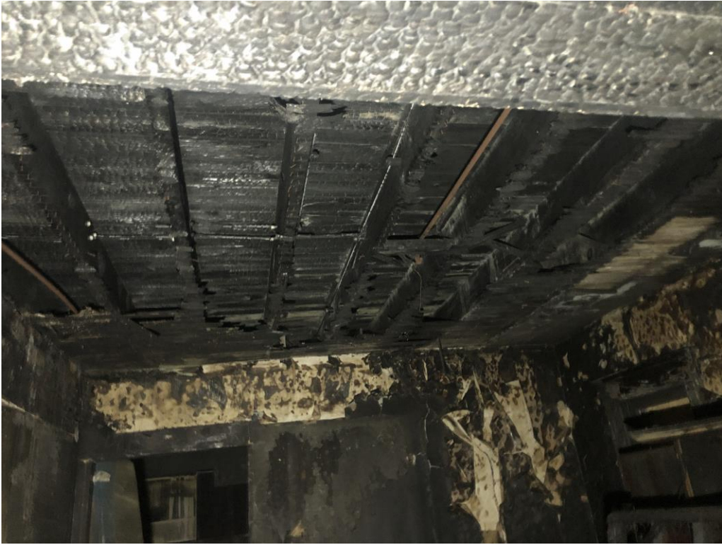
View of the fire damaged 2 nd floor joists