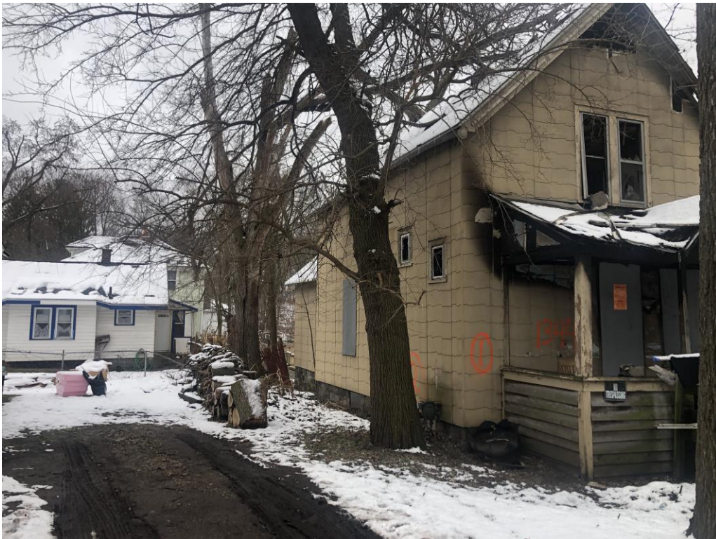
View of the left side of the house (EA-2)