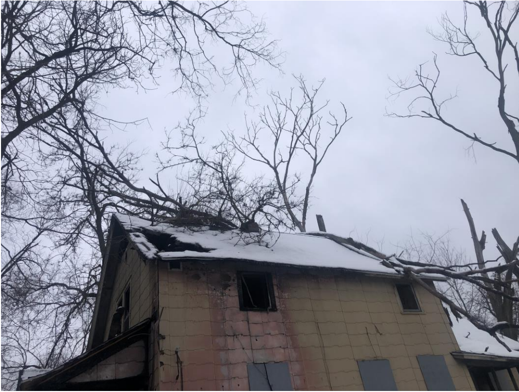
View of the roof (EA-5)