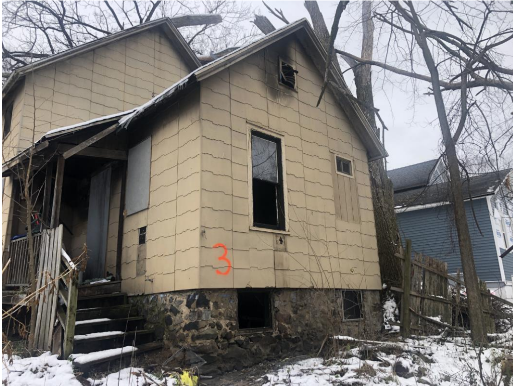
View of the rear of the house (EA-3)