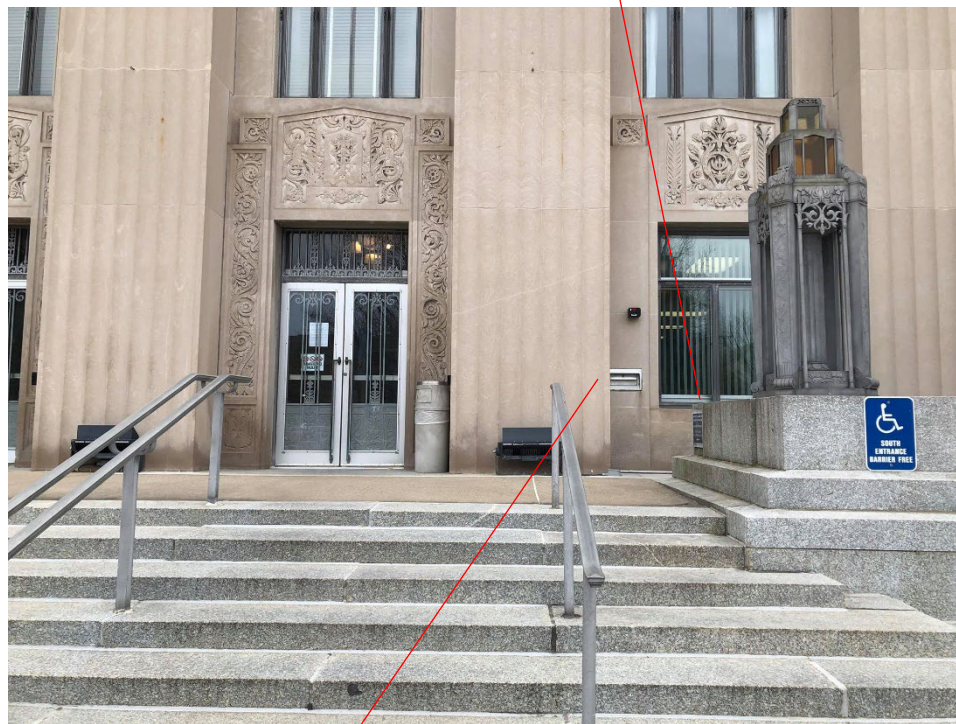
1. Open drop box located at City Hall.