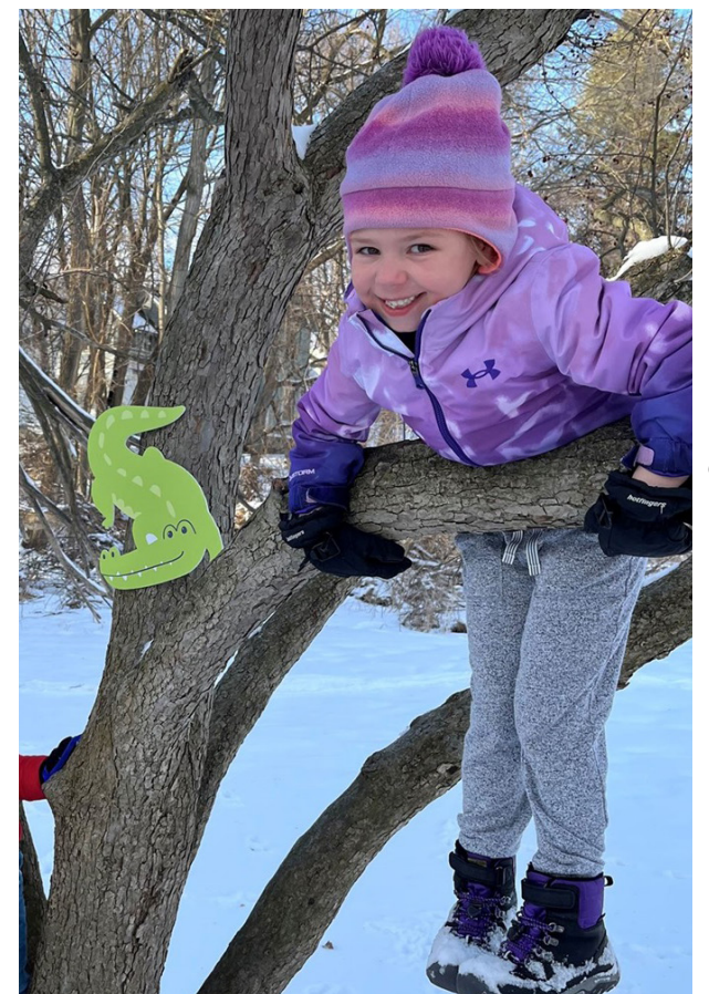
Explore Kalamazoo's city parks, follow the clues and find the hidden items in the Winter Scavenger Hunt!

Go on an adventure through city parks this winter to find hidden items on the Winter Family Scavenger Hunt! Use a map and clues to find items hidden in more than a dozen of our great city parks. Take a photo and share it for a chance to win prizes, too! The Scavenger Hunt starts on February 14 and ends February 28. It's self-paced, so explore at your own speed. Just make sure your photos are submitted before it ends. Visit kzooparks.org/ScavengerHunt for full details.