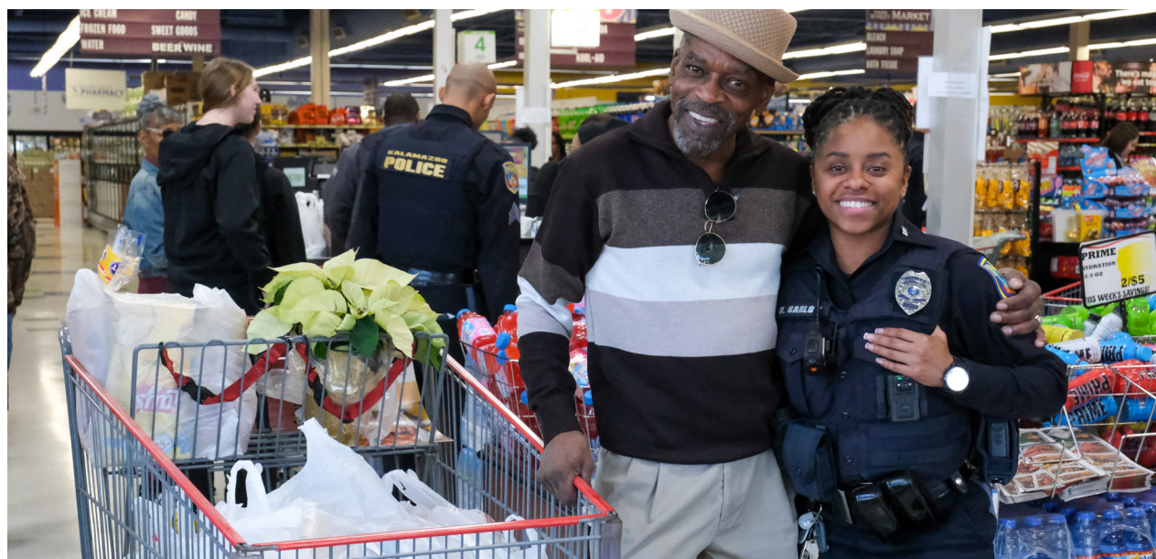
Kalamazoo's Public Safety Officers were delighted to have the opportunity to help shop for the holidays!